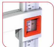
Two large windows and double-sided scale for easy readout.