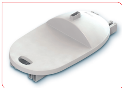
Integrated handle and secure catches on all individual parts for transport ease.